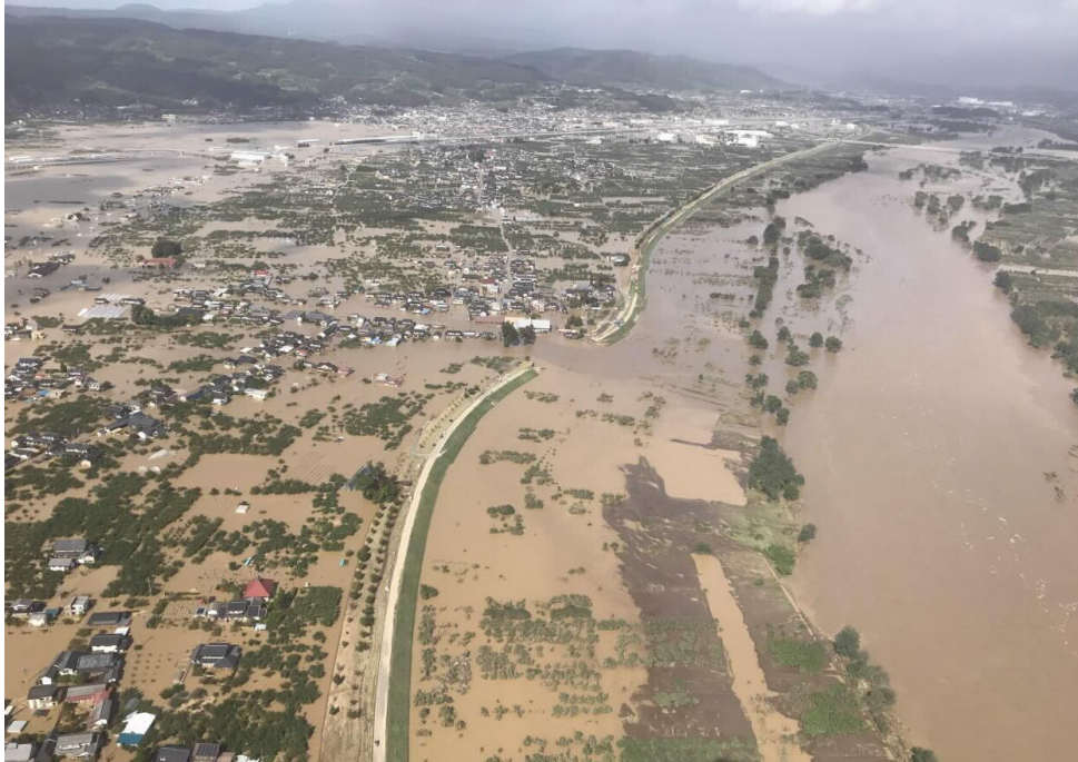
Damage in Nagano done by Typhoon Hagibis