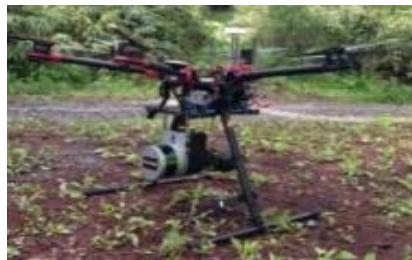
Forest resource assessment using a drone

Utilizing the leading advanced forestry ICT technology of Shinshu University and the Northern Nagano Forestry Cooperative, Nagano Prefecture is working on utilizing airborne laser and co-developing an on-line information sharing system of lumber shipment to make forestry our promising industry.