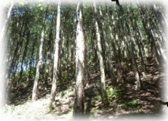
Hinoki cypress (Kiso Area)