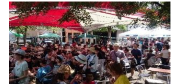
Wild Game Meat Fair (Nagano City)

We trained 107 cooks who can demonstrate true tastiness of Nagano Wild Game Meat (2013 ~ 2017).