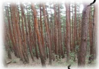
Red Pine (Chushin Area)