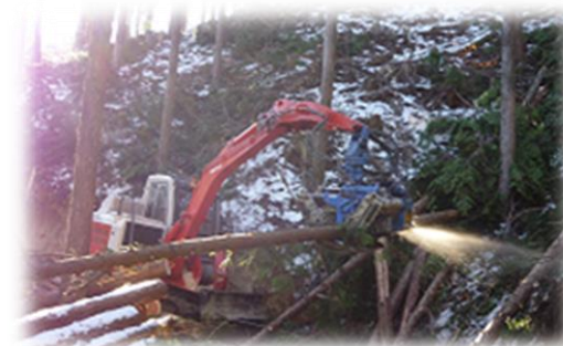
Forest maintenance is in progress.