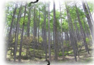
Larch (Toshin Area)