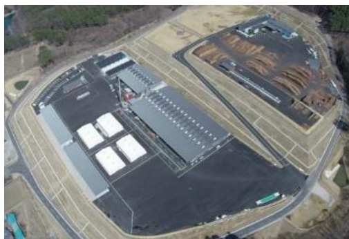
Bird's-eye view of a lumber processing facility (Shiojiri City)