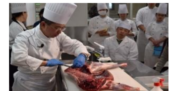
Training Sessions for Masters