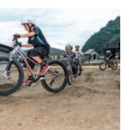
Hakuba 47 47 Mountain Bike Park

① MTB course, MTB tours bump tracks, etc. ② July-Setember